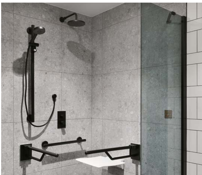
Removable grab rails and shower seat

Making the disabled guest experience as independent and inclusive as possible was central to owner, Bespoke Hotels', ambition for Hotel Brooklyn. To realise this vision, the UK's largest independent hotel group engaged inclusive design specialists, Motionspot, to design and supply Hotel Brooklyn's 18 accessible suites and build in attractive access principles and features throughout the hotel's communal areas which include conference rooms, a restaurant, bar, and mini cinema.