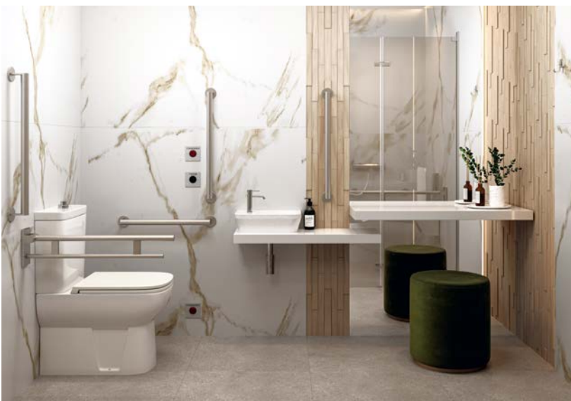
A Motionspot Doc M pack

Discuss your business' requirements with Motionspot's access and inclusion experts by emailing team@motionspot.co.uk or calling 020 3735 5139 .