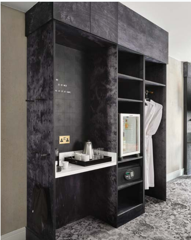
Accessible bedroom furniture including desk, safe, mini-bar, and adjustable wardrobe

Robin Sheppard, President, Bespoke Hotels