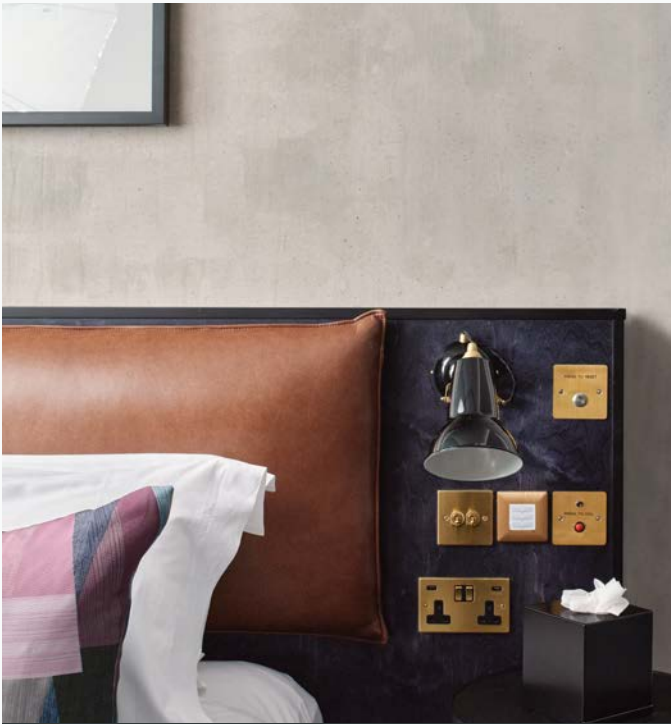
Electric curtain controls and switches